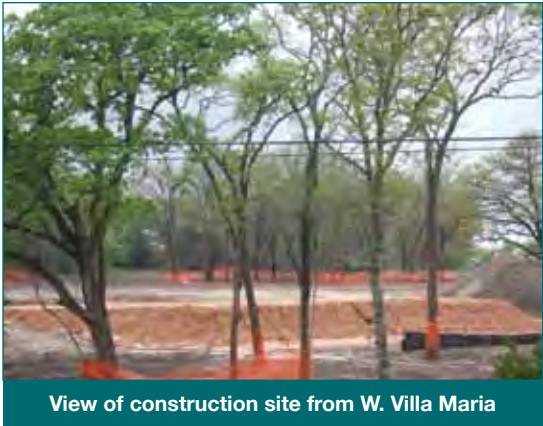
View of construction site from W. Villa Maria

some sacrifices were made, most notably accepting an architectural shingle roof as an alternative to the originally specified metal roof. Many in the congregation will also remember that a